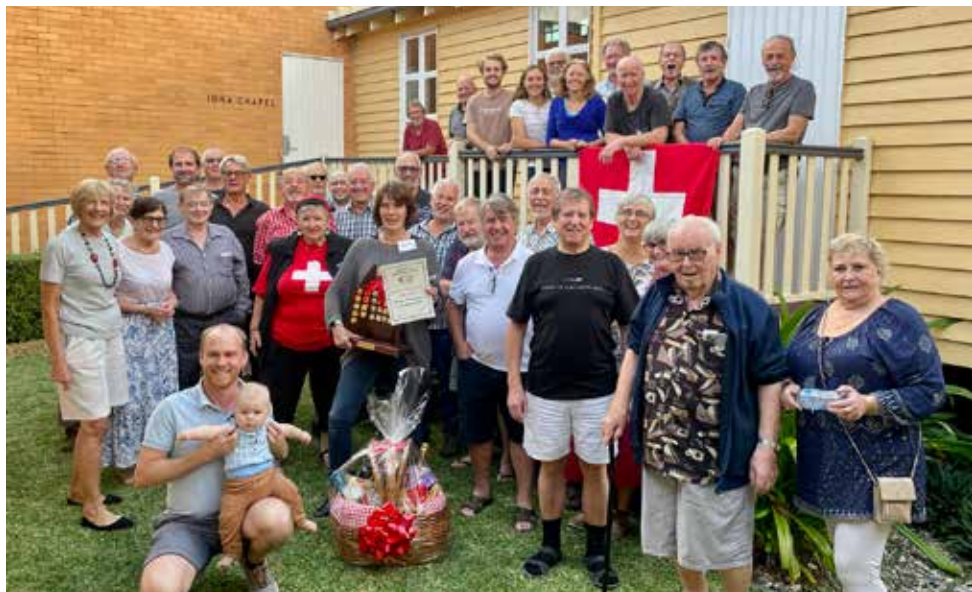
The 2022 Jass Meisterschaft group.