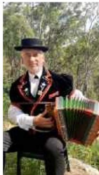
The video we recorded together.