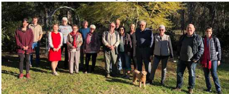
The Swozzie-group in Toowoomba on 1 August. It was so nice to meet friends in person again.