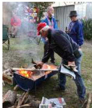
Looks like the Baerg-Roeseli team celebrated in style as always!