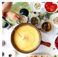
Nicole Berner's two creative food photos – a close runner up!