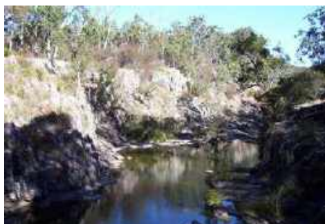
Koreelah Creek Gorge