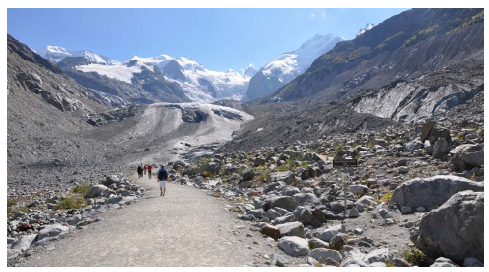
The Morteratsch Glacier is the largest glacier by area in the Bernina Range of the Bündner Alps in Switzerland.

Lunchers and socialisers should also book for catering purposes.