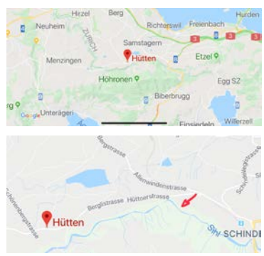
Location where photo was taken