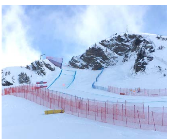
View of the spectacular jump "Hundschopf"