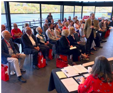
The Swiss Clubs Presidents' Conference in Sydney